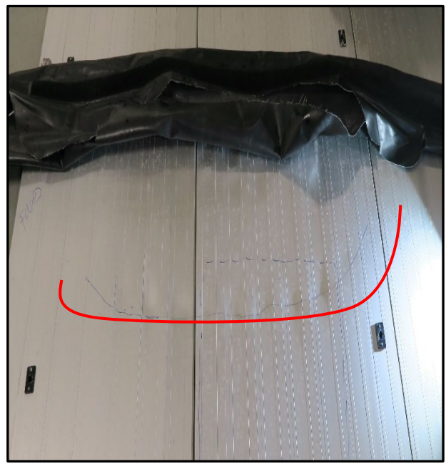
Figure 2 – Ruptured keel bladder and the view of the underside of the metal floorboard. The red line has been added to highlight the deformities in the metal due to the keel bladder rupture.

During a recent investigation of an incident that occurred involving foreign cruise vessel operations in the Antarctic, a U.S. passenger was severely injured due to a Zodiac MILPRO model FC 580/MK5 keel bladder failure while underway on a sightseeing excursion. In calm weather, the keel bladder suddenly ruptured, sending the passenger several feet into the air before landing onto the deck and sustaining serious injuries including a fractured femur. Another passenger was thrown overboard into the freezing water, risking hypothermia.