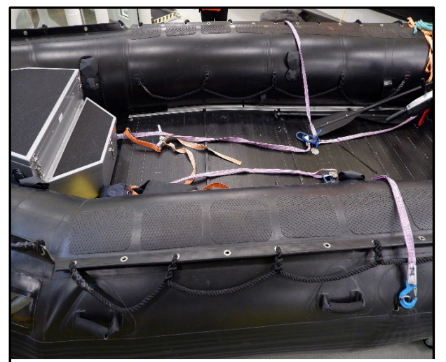
Figure 1 -Zodiac after bladder failure. Deformation to the deck is visible.

This safety alert addresses the importance of proper maintenance and adherence to manufacturer's recommendations for filling/inflating buoyancy chambers on some models of inflatable boats.